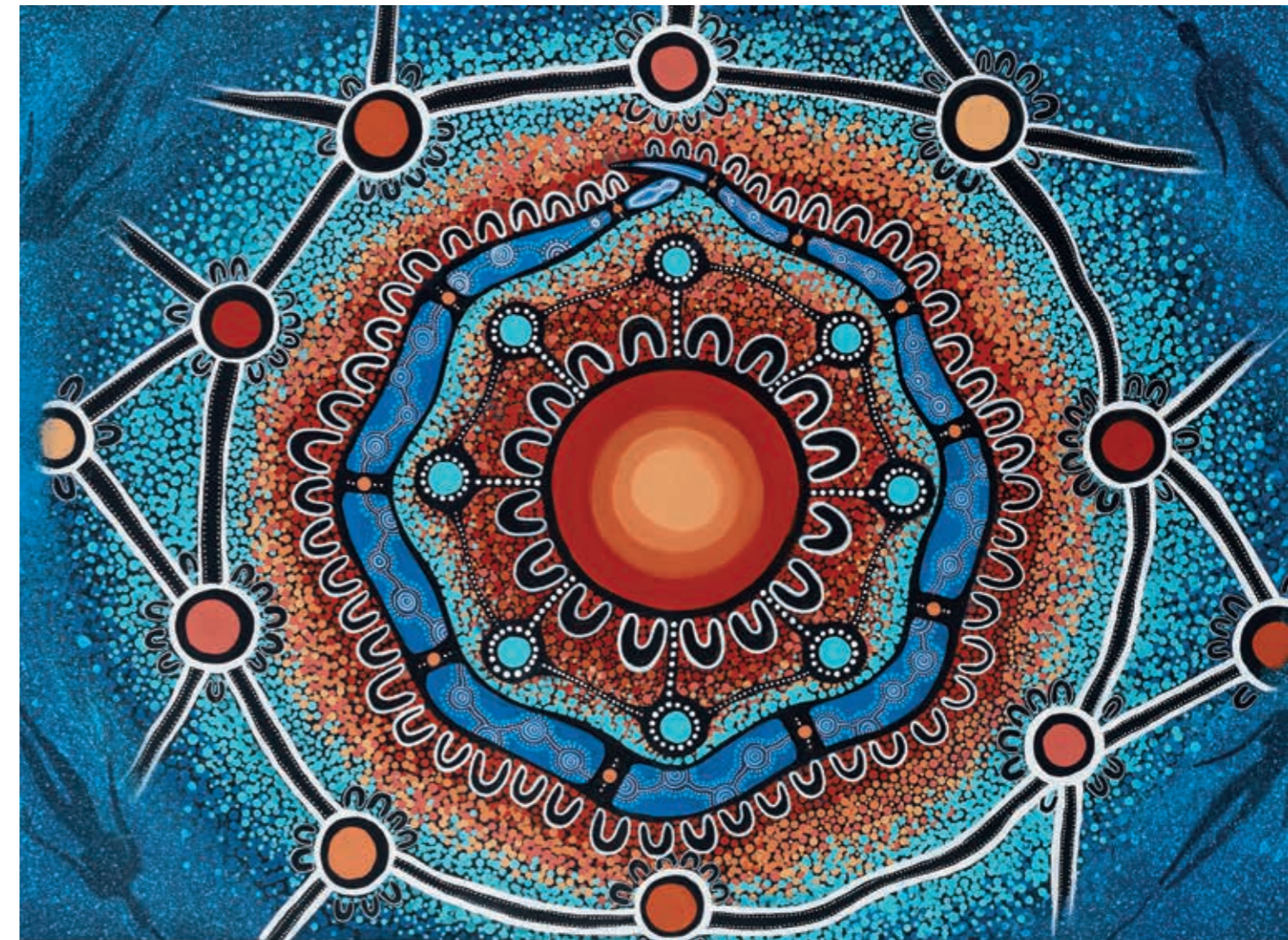
Pictured above artwork was commissioned for the Moorditj Yorga Scholarship Program. This represents the transference and continuity of knowledge between generations of Aboriginal women since creation.

If you get ABSTUDY living allowance, you may also get other payments such as ABSTUDY additional assistance, rent assistance and student start-up loans. Applications are assessed on an individual basis. For more information, visit servicesaustralia.gov.au/abstudy or Tel: 1800 132 317 .