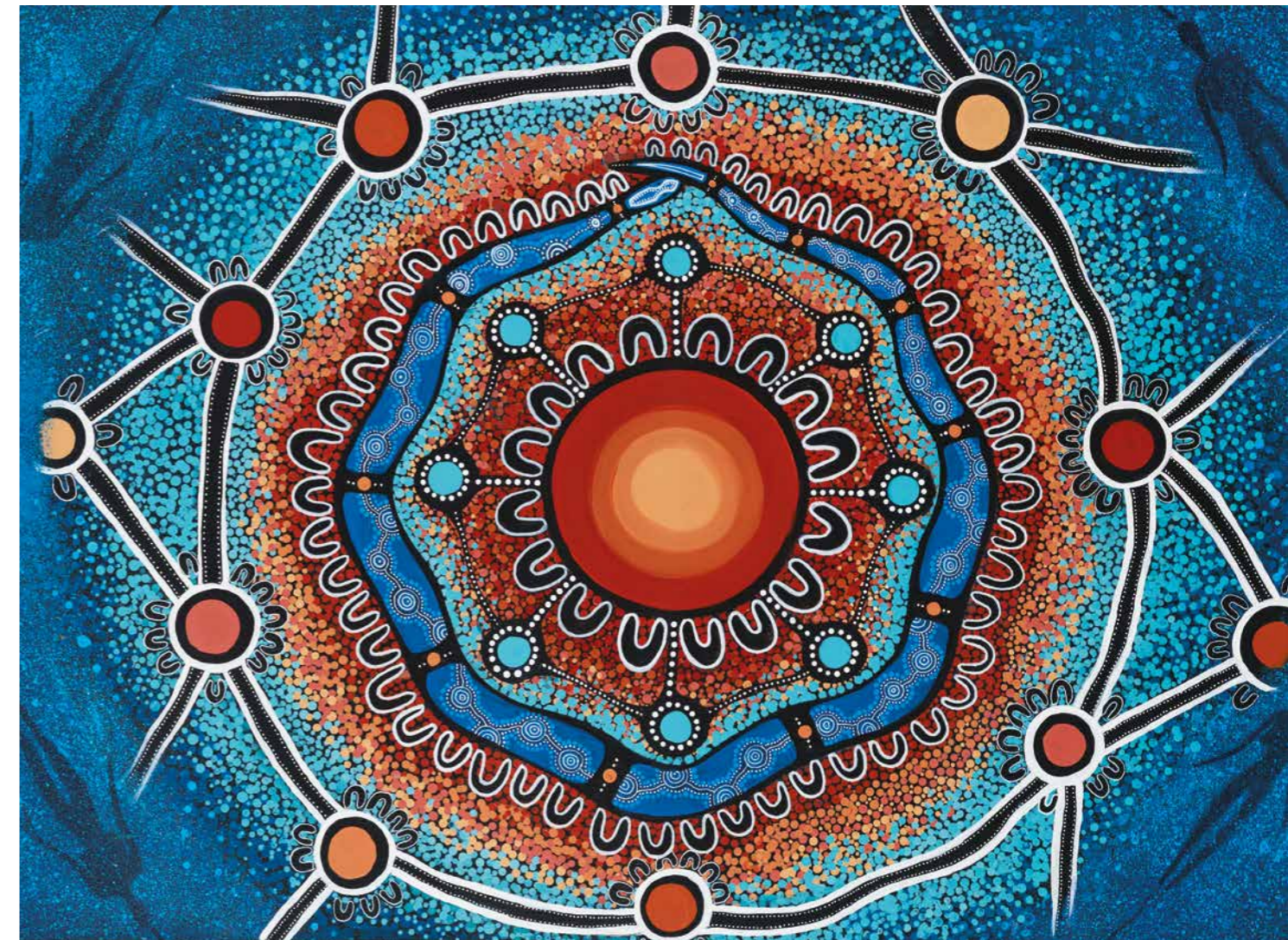
Pictured above artwork was commissioned for the Moorditj Yorga Scholarship Program. This represents the transference and continuity of knowledge between generations of Aboriginal women since creation.

If you get ABSTUDY living allowance, you may also get other payments such as ABSTUDY additional assistance, rent assistance and student start-up loans. Applications are assessed on an individual basis. For more information, visit servicesaustralia.gov.au/centrelink .