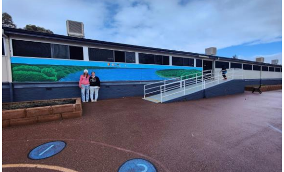
2023 Avonvale Primary Mural, Northam