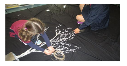
2018 Harmony Primary- Stop Motion