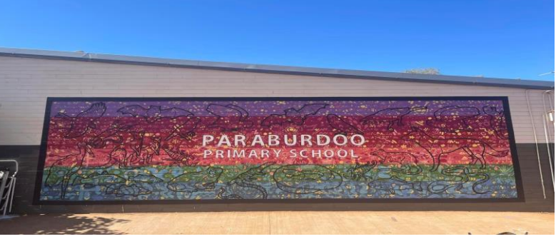
2023 Paraburdoo Primary Mural, Paraburdoo