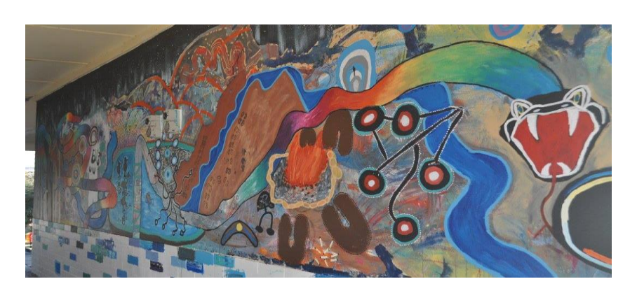
2018 Mullewa DHS Remote/Rural Placement Project - Dreaming Mural (100% Indigenous Student Group) with support from local Aboriginal Elders