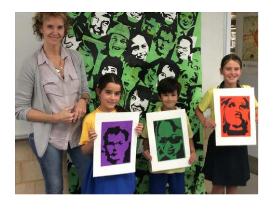
2018 Dalmain Primary - ground mural