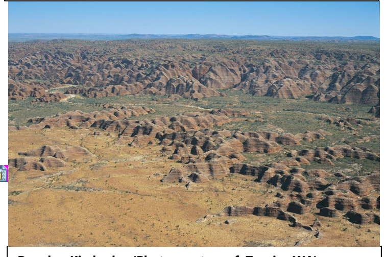
Bungles, Kimberley