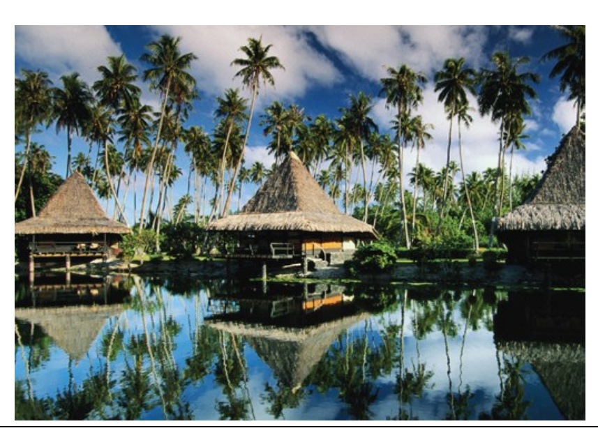
Curtin students will have the opportunity to experience Mauritius tourism